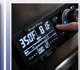
Patented iQue™ Technology