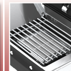
Powerful Infrared Side Burner