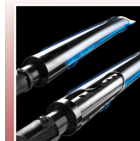
Stainless Steel Dual-Tube™ Burner System