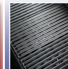
Heavy Flav-R-Cast Iron Grids